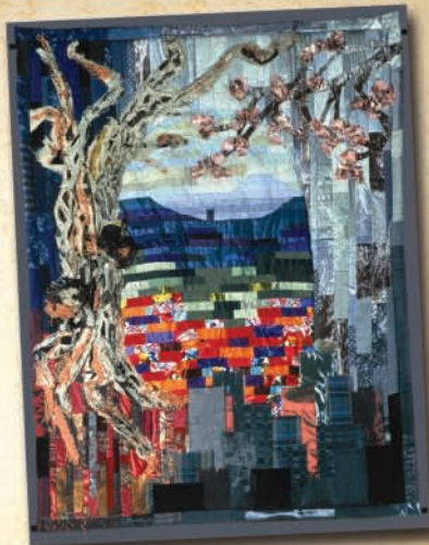
A. E. Housman Tapestry

For further information about visiting Ludlow and The Shropshire Hills contact: