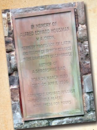
A. E. Housman Memorial